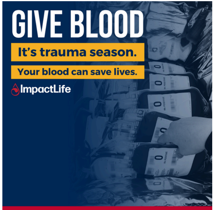
Instagram or Facebook Post