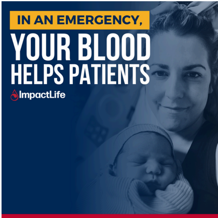
Instagram or Facebook Post

#TraumaSeason #PartnerForLife #GiveBloodSaveLives